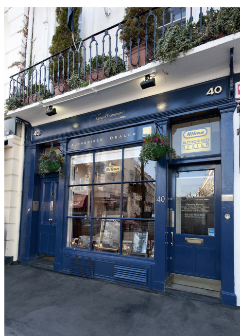
The London store offers modern Nikon cameras

Anyone looking for a new or second-hand Nikon will find something of interest at Grays of Westminster. The store stocks the entire current range of Nikon DSLRs and the Z series of mirrorless cameras. Additionally, it sells the extensive range of autofocus (AF), AF-S (Silent Wave), AF-P (Stepping Motor) and DX and FX Nikkor lenses, manual-focus Nikkor lenses plus Speedlights and a vast range of Nikon accessories, from eyepiece-correction lenses to lens hoods. The second-hand range is equally comprehensive, and the store offers